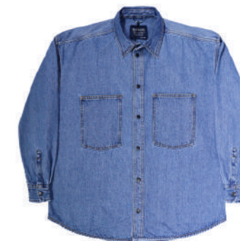
MEN'S DENIM SHIRT TWP&B-22