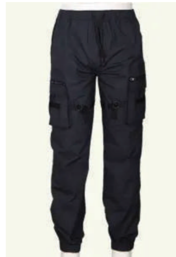
MEN'S NON-DENIM BOTTOM TWAR