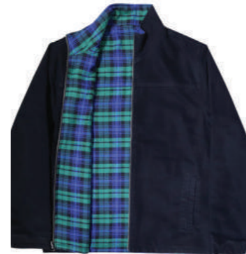
MEN'S DENIM JACKET TWAR-169 (OPT 01)