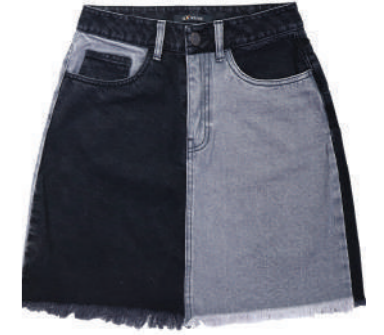
WOMEN'S LADIES SKIRT TWAR-238