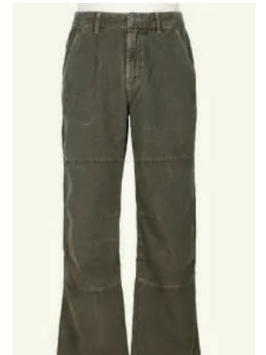
MEN'S NON-DENIM BOTTOM TWAR-88