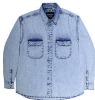
MEN'S DENIM SHIRT TWP&B-04