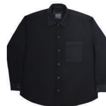
MEN'S DENIM SHIRT TWP&B-22C