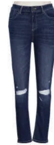
WOMEN'S BOTTOM DENIM NZ2916 A