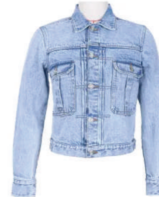
WOMEN'S DENIM JACKET TWAR-57