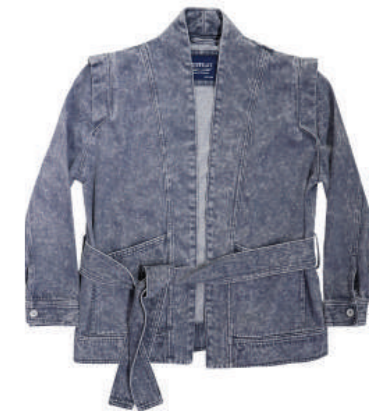
WOMEN_S DENIM JACKET TWAR-202