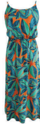
LADIES TOPS COL- LECTION TWAR- 309