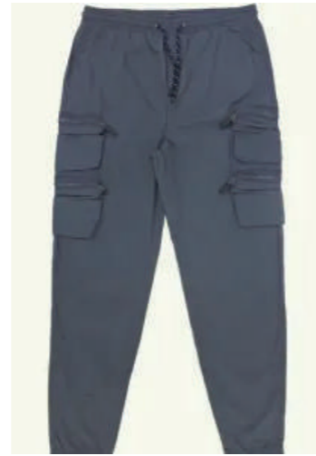
MEN'S NON-DENIM BOTTOM 20-A0847