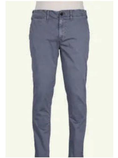
MEN'S NON-DENIM BOTTOM TWAR- 111 B