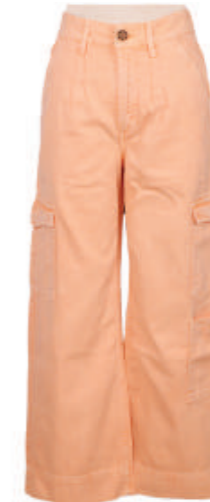
WOMEN_S WOVEN BOTTOM TWAR-42