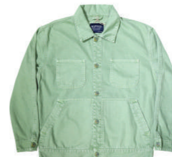
MEN'S DENIM SHIRT TWP&B-05A