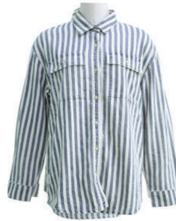
LADIES DENIM COL- LECTIONS TWAR- 11