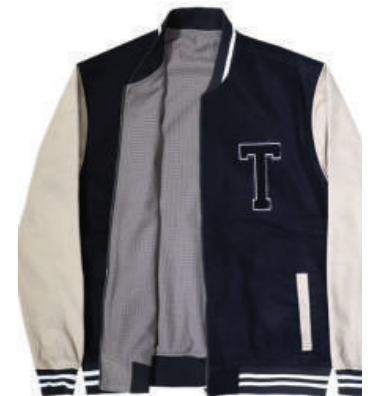
MEN'S DENIM JACKET TWP&B-02 (OPT 02)