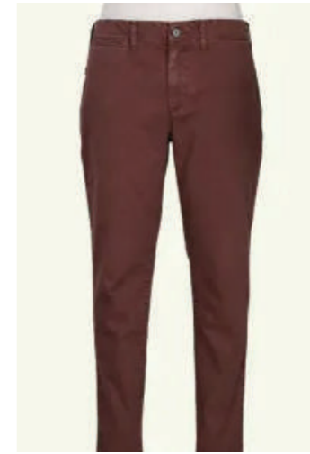
MEN'S NON-DENIM BOTTOM TWAR- 111