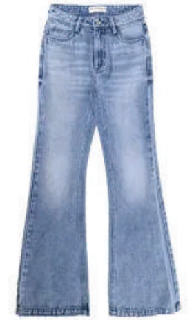
WOMEN'S BOTTOM DENIM TWRD – 59