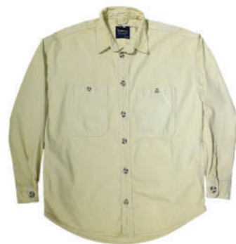
MEN'S DENIM SHIRT TWAR-177