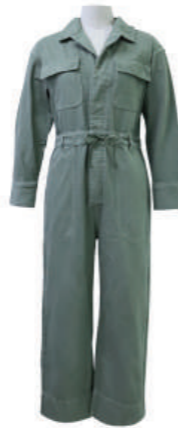
LADIES DENIM COL- LECTIONS TWAR- 483