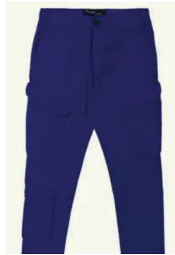
MEN'S NON-DENIM BOTTOM ARTW-53