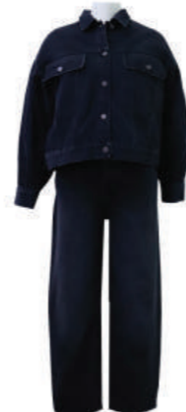
LADIES DENIM COL- LECTIONS TWAR- 521