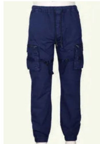
MEN'S NON-DENIM BOTTOM TWAR