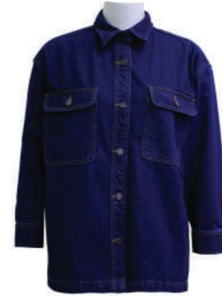
LADIES DENIM COL- LECTIONS TWAR- 211