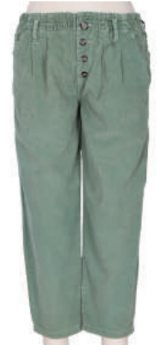
WOMEN_S WOVEN BOTTOM TWAR-64