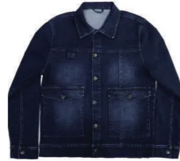
MEN'S DENIM JACKET TWAR-128