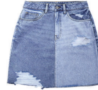
WOMEN'S LADIES SKIRT TWAR-237