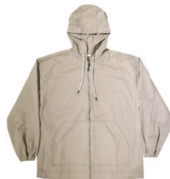
MEN'S DENIM SHIRT TWP&B-03C