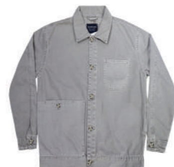
MEN'S DENIM SHIRT TWP&B-05