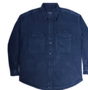
MEN'S DENIM SHIRT TWP&B-22A