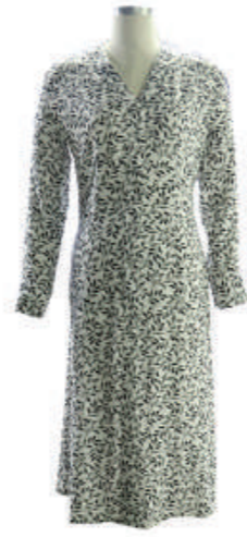
LADIES TOPS COL- LECTION RND-21