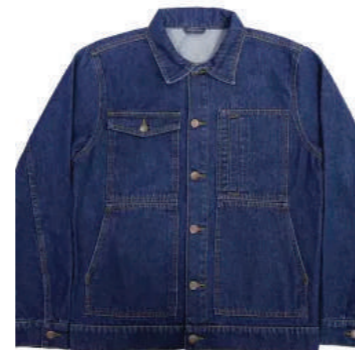
MEN'S DENIM JACKET TWAR-130