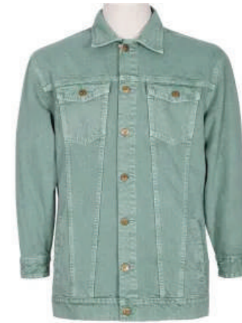
MEN'S DENIM JACKET TWAR-56A