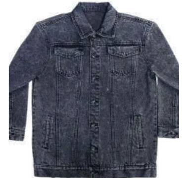
MEN'S DENIM JACKET TWAR-70