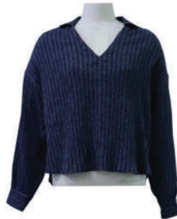
LADIES TOPS COL- LECTION TWAR- 509