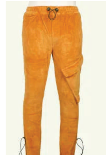
MEN'S NON-DENIM BOTTOM TWAR-15