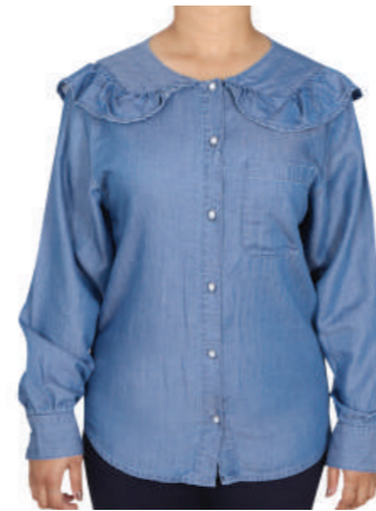
LADIES TOPS COL- LECTION TWAR-208