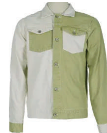
MEN'S DENIM JACKET TWAR-91 A