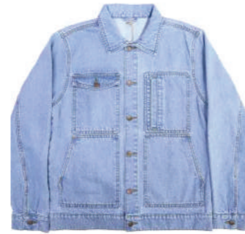
MEN'S DENIM JACKET TWAR- 130 A